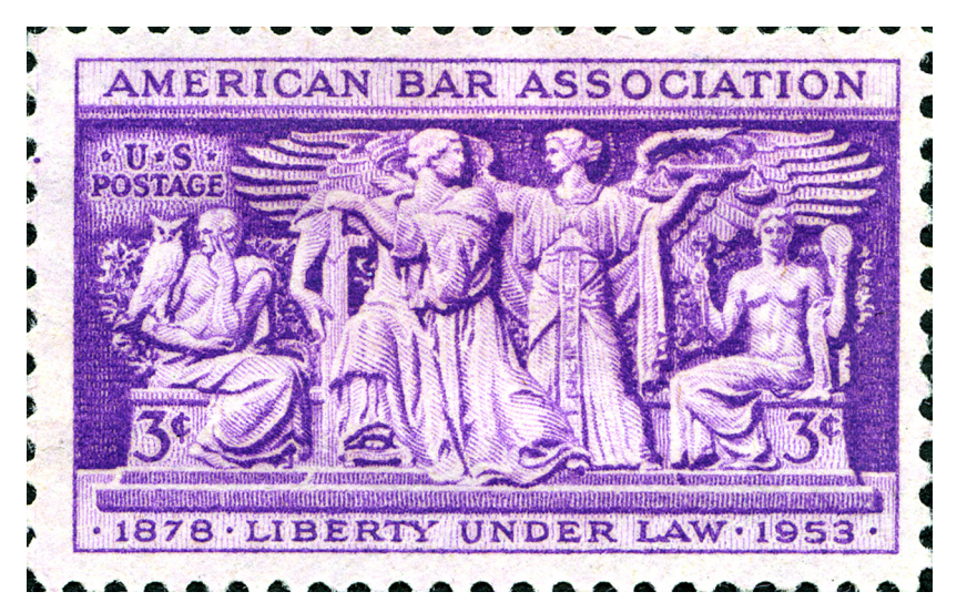
Frieze by Fraser is on Supreme Court Building in Washington.